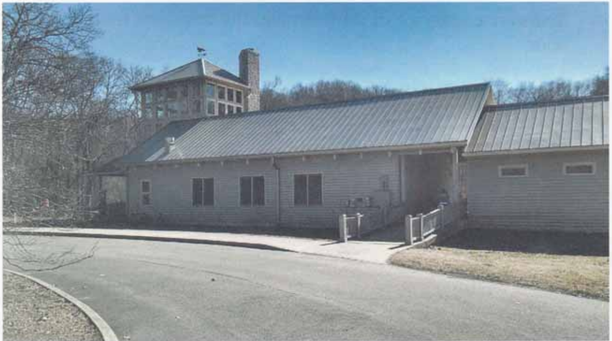
Warner Nature Center