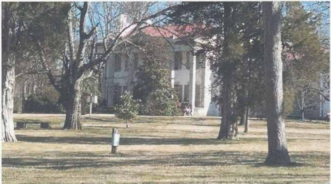
Belle Meade Mansion