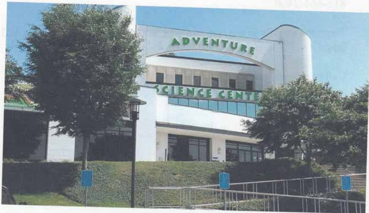
Adventure Science Center