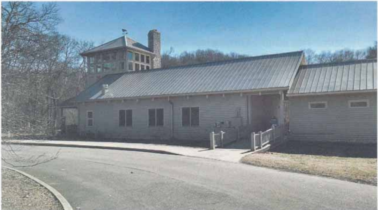
Warner Nature Center